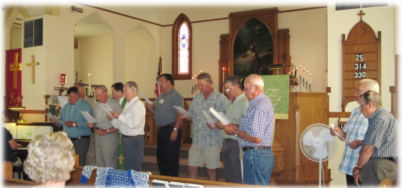
Men's Choir singing in Norwegian during the service