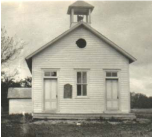
Grover School House