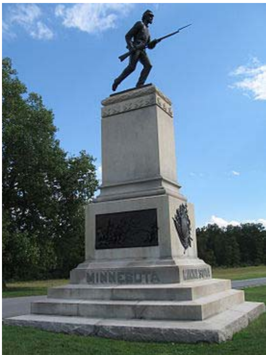
MONUMENT TO THE 1ST MINNESOTA CEMETERY RIDGE GETTYSBURG BATTLEFIELD, GETTYSBURG, PENNSYLVANIA.

civil rights for black people. Individuals stood up for what they believed and some were imprisoned even killed for taking a stand for justice. When I went to Chaplain School in Montgomery I had an opportunity to tour many of the historic sites of the civil rights era. Another MN Lutheran and I drove to Selma Alabama which was the start of the most famous march of the civil rights movement as thousands of people of all backgrounds marched peacefully from Selma to